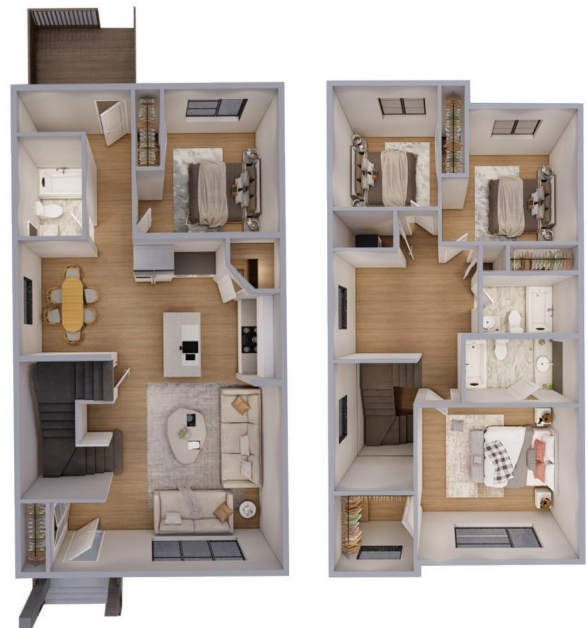
869 SQ.FT. MAIN FLOOR

Date Listed March 7th, 2025 Days on Market 40 Zoning Zone 91