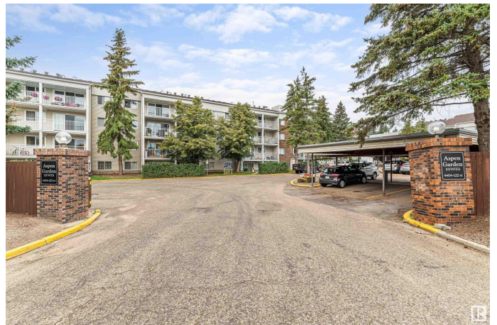
401-4404 122 St NW, Edmonton, AB