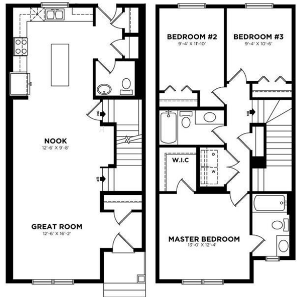
MAIN FLOOR - 773 SQFT