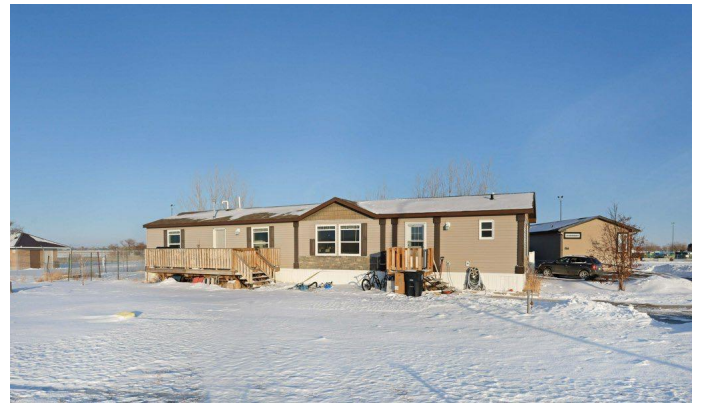
127 Meadowplace Dr E, Brooks, AB

Main Floor Exterior Area 1517.55 sq ft Interior Area 1391.31 sq ft