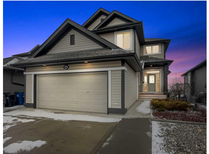
48 Sunset Cl, Cochrane, AB

Step inside to find a sun-filled interior, with large windows framing the breathtaking mountain vistas. Hardwood floors lead you from the welcoming foyer into the expansive living space, where the kitchen, dining, and living room flow seamlessly together. The gourmet kitchen features beautiful cabinetry, a large wrap around eat-up island that easily sits 8, granite countertops, stainless steel appliances, ample pantry space—perfect for both cooking and entertaining. Off the large kitchen dining, an patio space ideal for hosting barbecues, reading a book or simply enjoying the stunning mountain views, sunsets and nature at large. The cozy living room includes a gas fireplace, setting the tone for a warm and inviting space to relax during our cold winter months and Central A/C for our hot summer months.